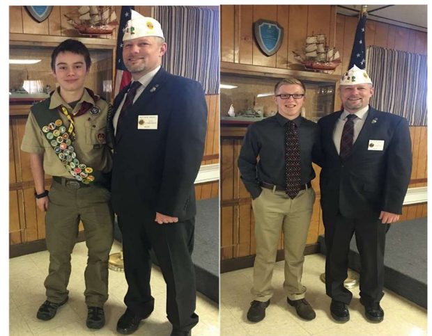
Involving our local youth!